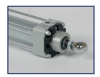
The presence of the rear joint with pin and of the adjustable spherical front joint facilitates installation operations, allowing correct operation even on gates that are not perfectly aligned.