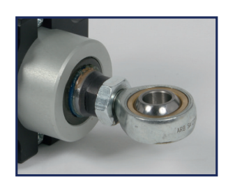
Adjustable front joint allowing stroke regulation.