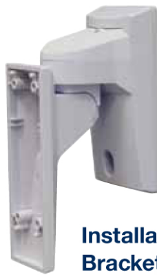
Installation Bracket kit