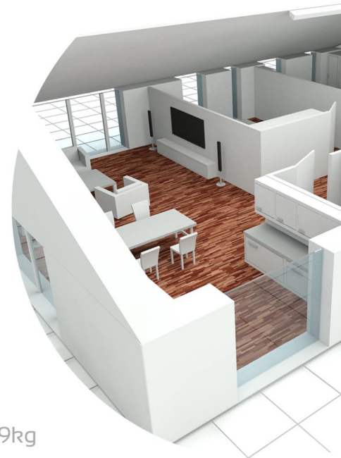
Total Weight: 1.59kg